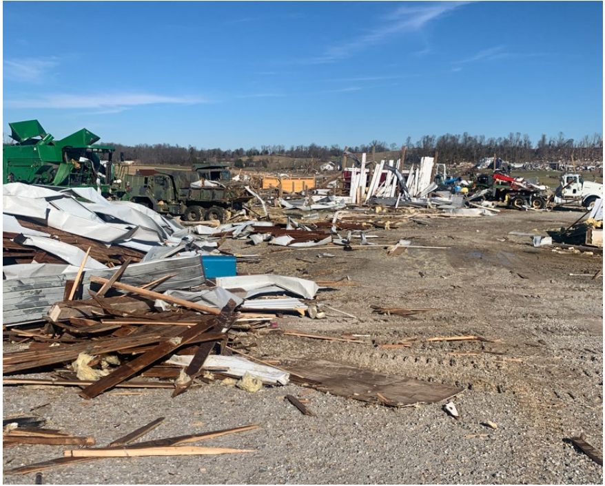
Damage to farm equipment, storage sheds, and one of the cattle handling facilities at the UKREC.

When securing animals on a storm-damaged operation, evaluating feed and water resources is also essential. It is possible that even if your operation only sustained minor damages, that impacts to surrounding areas could impact municipalities. It may be necessary to haul water to cattle. The storm may have affected feed resources, including hay, grain, and feeding equipment. People in the agricultural community are quick to jump in and help, so taking a few moments to determine your needs will allow others to assist you more efficiently. At the UKREC, we lost water and needed to have water trucked in for several days.