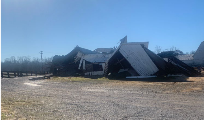
Damage to one of the barns at the UKREC beef unit

The University of Kentucky Research and Education Center in Princeton, KY, suffered catastrophic damages from an EF-4 tornado on the evening of December 10th. Although the destruction left behind is devastating, the University of Kentucky community is fortunate that there was no loss of life amongst our colleagues, and injuries were minor. Unfortunately, the beef herd at the UKREC lost cattle in the storm and in the days that followed. However, when standing in the rubble of our buildings or in our debris-ridden pastures, I often find myself thinking that it is truly a miracle that our people and our cattle were not more severely impacted by the storm.