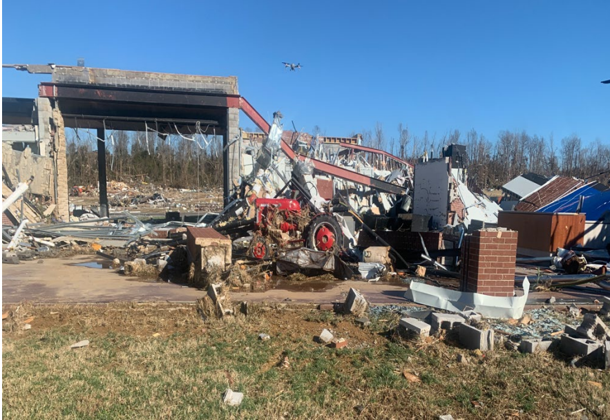
This Farmall Cub tractor was one of the original tractors used at the UKREC. It had previously been restored by the farm staff and was on display in the lobby of the UKREC and Grain and Forage Center of Excellence.

Cattle may also abort due to the stress of weather events. Pregnancy is a luxury; it is not necessary for survival. When cows experience stress, such as extreme weather events, biological processes kick in to help them survive (think fight or flight response). These processes affect every part of the body with the end goal of helping the cow survive. Thus, luxury processes such as pregnancy or even lactation can be negatively affected by stress. Keep a close eye on nursing calves in the days and weeks following storms, especially those whose dam may have been injured or killed due to the storms.