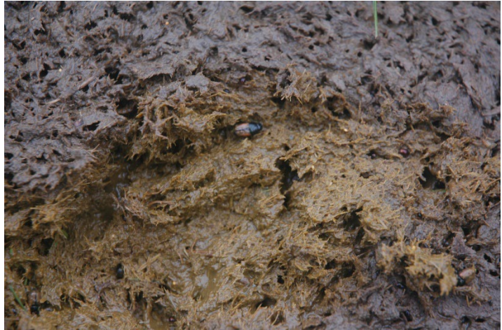
Figure 3. Nitrogen fixed by legumes is shared indirectly with grasses through grazing and subsequent deposition of dung and urine. In this photo dung beetle is hard at work breaking down a cow patty.

Always inoculate or use pre-inoculated seed. Since legumes fix nitrogen from the air by forming a symbiotic relationship with Rhizobium bacteria, inoculating seed with the proper strain of nitrogen fixing bacteria prior to planting is the best way to ensure optimal fixation.