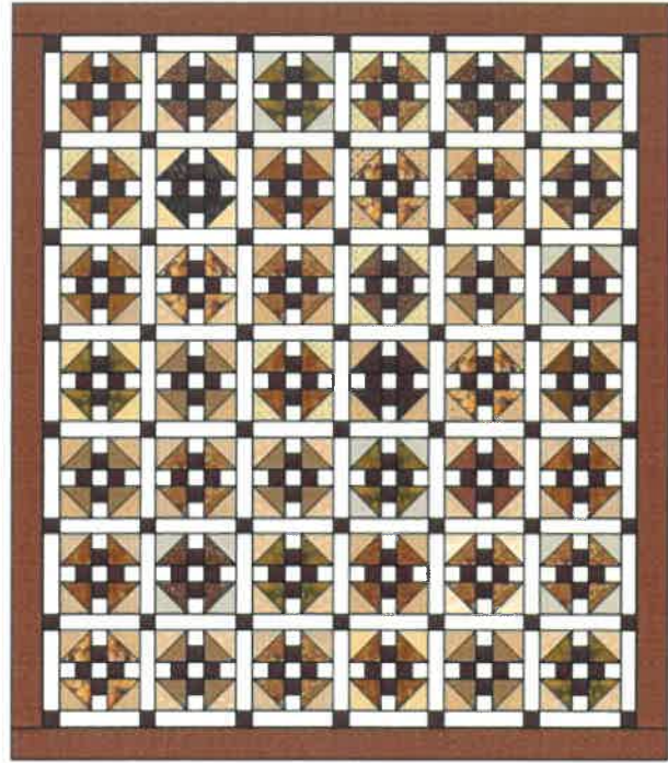
Joy's Color Way